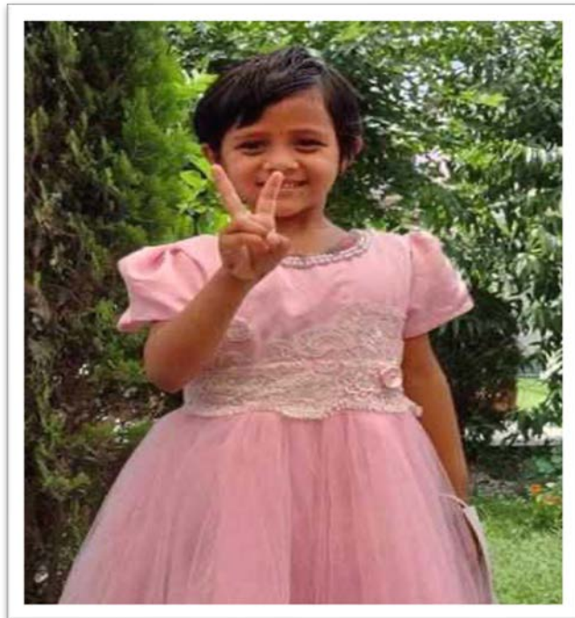
Love our new dress