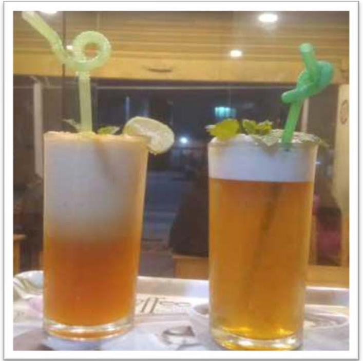
Lemon Ice tea and Peach ice tea

The older children are actively working at the café. One girl who completed her +2 level is working as a staff at the café. Two other girls who were interested are also working as volunteers at the café.