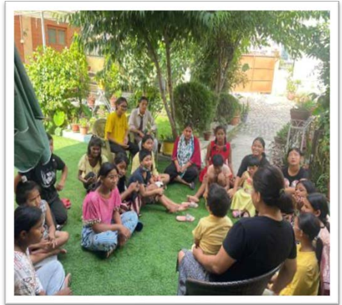
Love to talk with didis