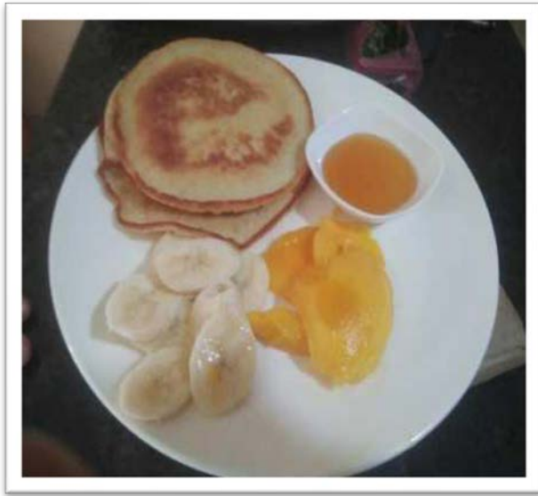
Banana pancake with honey Hot lemon juice