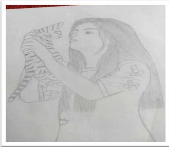
Art made by children